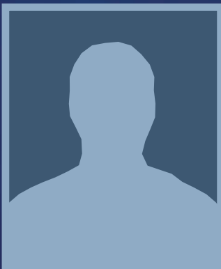
2011 (Not known at time of printing)